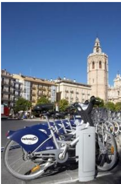
Fig. 3. Bike rental station in Valencia (Ajuntament de Valencia, Valenbisi)

Although the technical realisation did not propose, the sizes of stations were suggested in that case study. The modules from 10 up to 40 positions were considered (modules with 10, 15, 20, 25, 30, 35 and 40 stands). The inspiration was taken from other cities. Table 1 shows the situation in some European cities. The rental services have more stand than bicycles to guarantee space for parking. The ration is about 10. The number of bicycles and stands per 1000 inhabitants very vary in cities. The redistribution of bicycles between stations is sometimes necessary. It happens especially in the morning when commuters arrive at the main railway station, and bike rental station is empty very quickly. Inverse situation is in the afternoon.