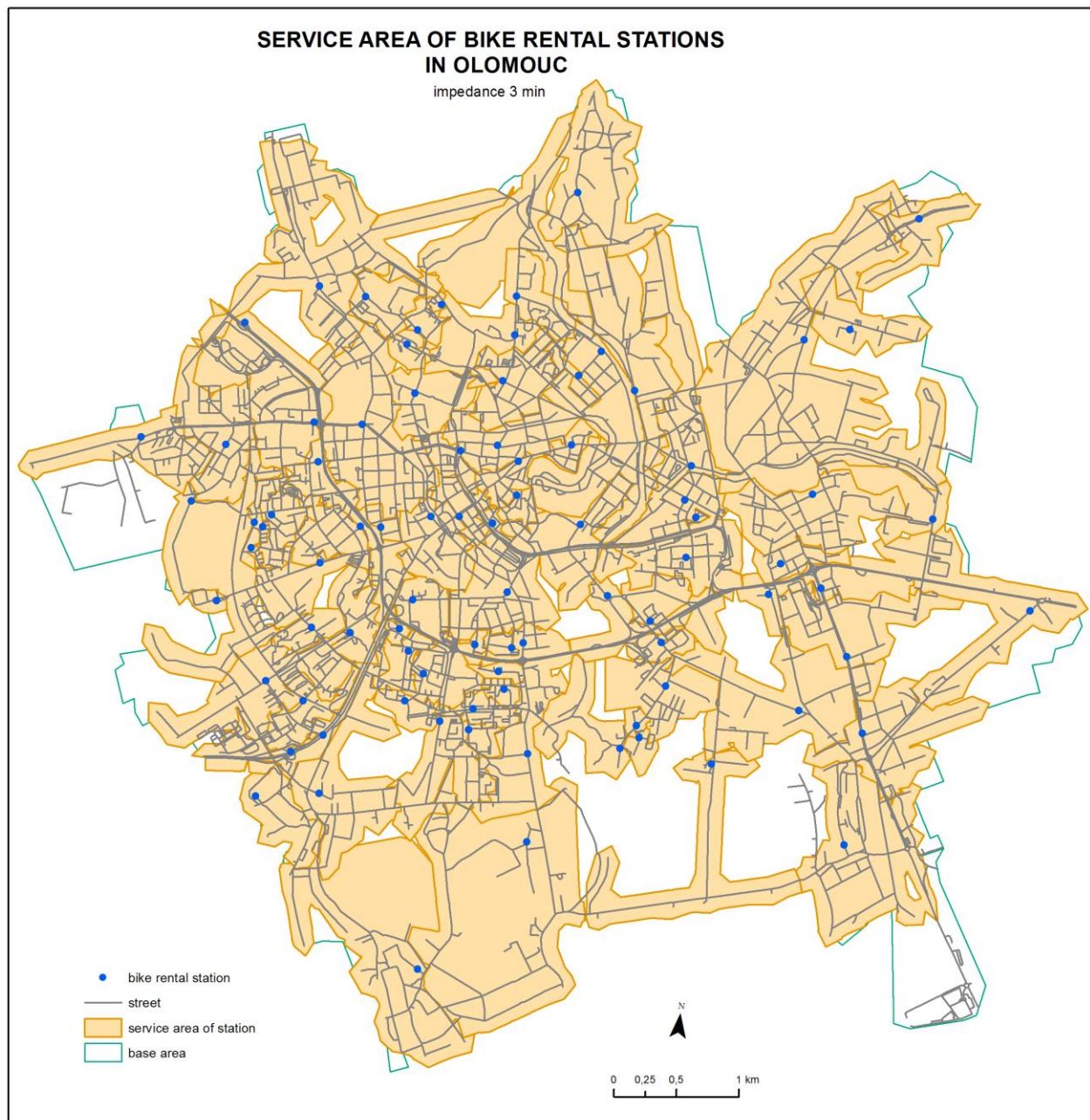
Fig. 2. Service area of bike rental stations in Olomouc (Hybner 2013)