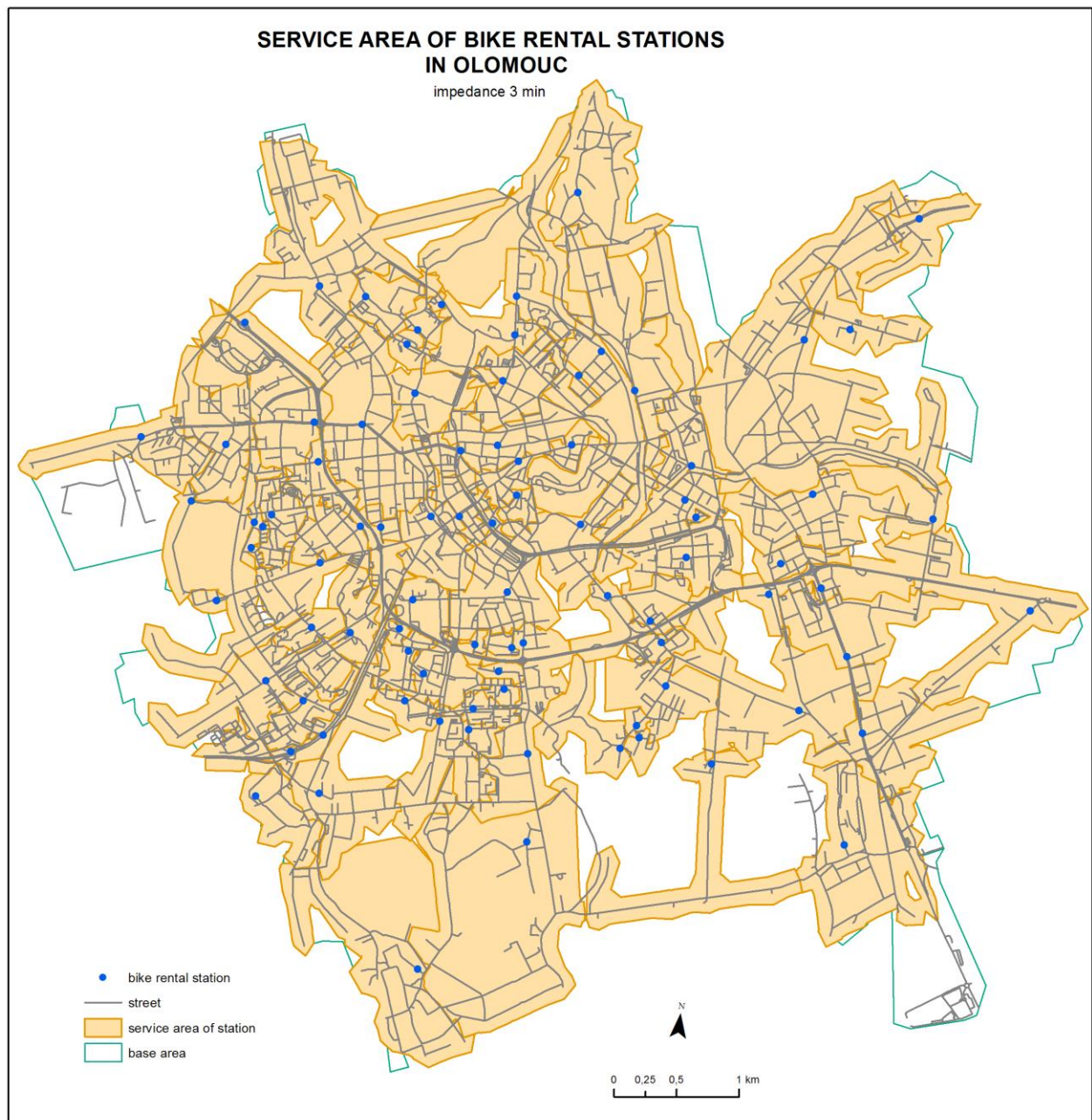
Fig. 2. Service area of bike rental stations in Olomouc (Hybner 2013)