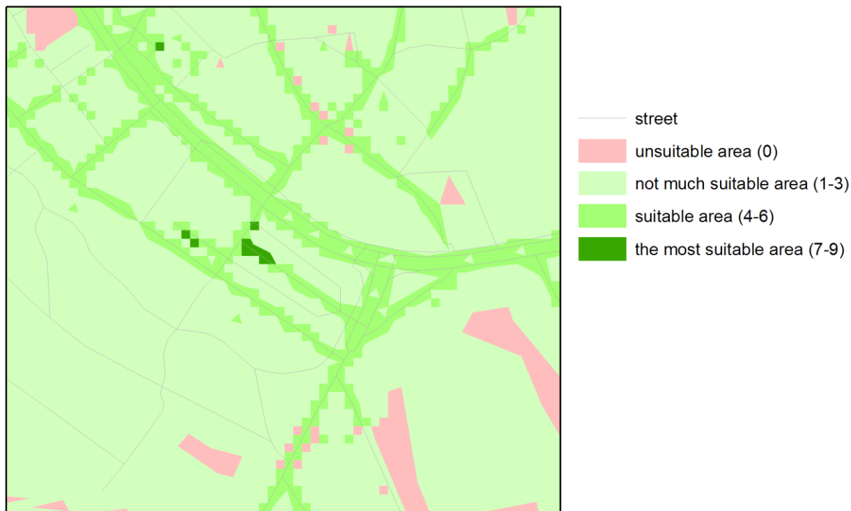
Fig. 1. Part of the raster of suitable areas